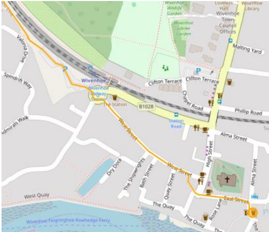
Black Buoy, Wivenhoe to the Wivenhoe Trail