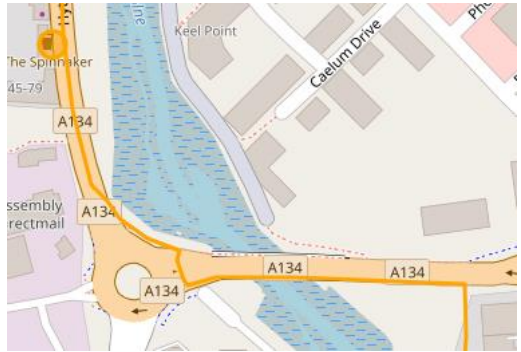
Hythe Quay to the Spinnaker