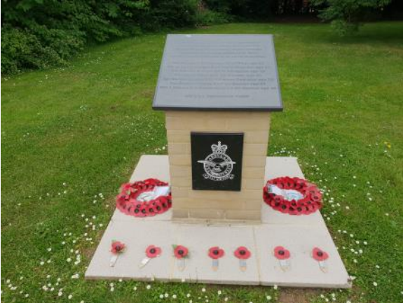
The memorial to the crashed Lancaster