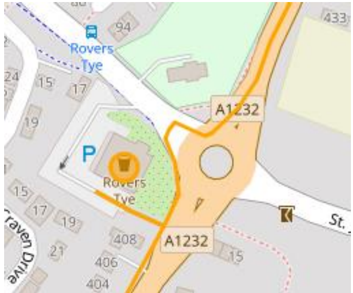
The Rovers Tye - main entrance is from the car park