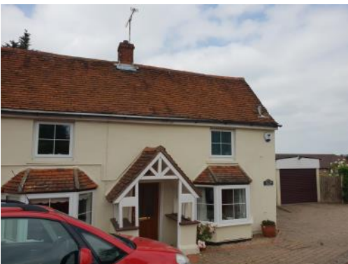
Lion & Lamb Cottage, a now lost pub which was at one time Ind Coope