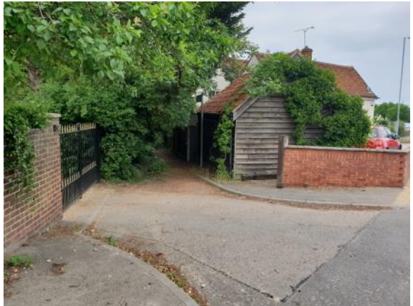
The footpath at the district boundary