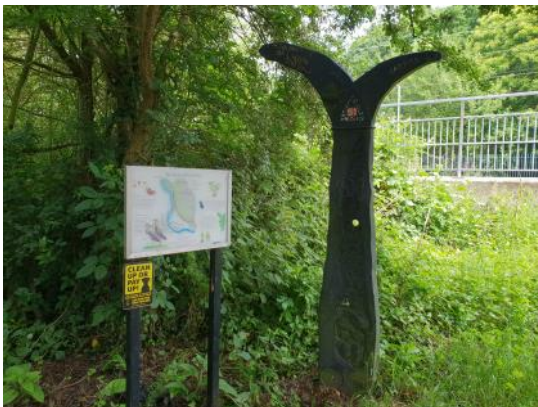
A Mills type marker post at the start of the Wivenhoe Trail. Now on National Cycle Route 51 this used to be part of the old route for route 1.