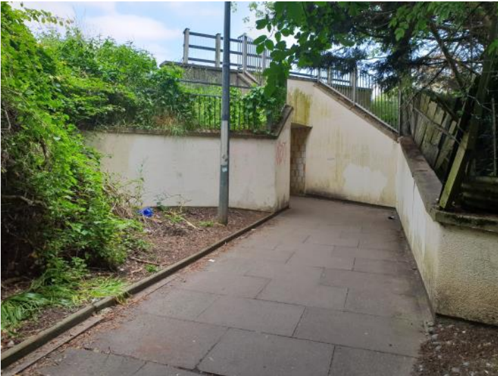
Where the path between the houses reaches the A133 subway